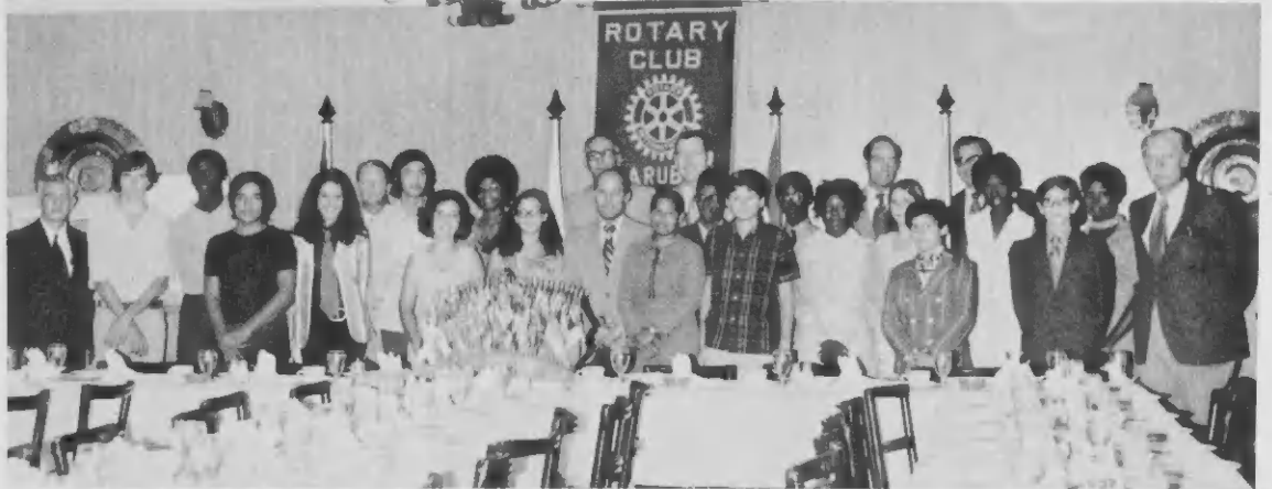
The students, between 15 and 20 years of age, were selected by their respective consuls as special guests at a dinner at the Trocadero. The students represent the U.S.A., Portugal, Colombia, Chile, Venezuela, Guyana and China.

Aruba Rotary ta honra 20 estudiantes di diferente nacionalidad durante "Siman di Amistad" ariba October 16.